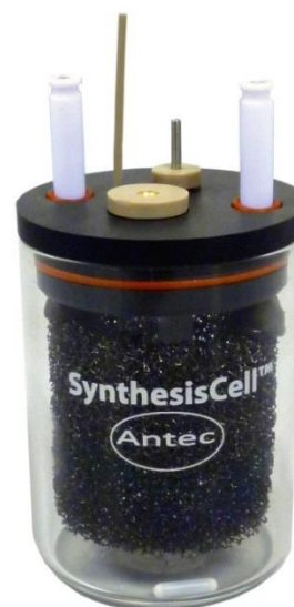
Figure 1. Synthesis Cell with Reticulated Glassy Carbon WE electrode (RGC).